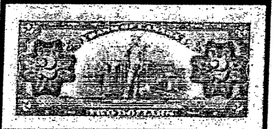
Click to view supersized image

Curiosity finally got the best of the lady, and she called a locksmith to drill open the safe. Inside she found over $4,800 face value in Canadian banknotes dated from 1935 to 1954, mostly in uncirculated condition in old envelopes. Some of the highlights included these virtually perfect gem uncirculated 1935 $2 notes, two consecutive uncirculated 1935 $50 notes, and several high grade 1937 Osborne signature $50 notes. Notes like these are virtually never available at any price. I am absolutely thrilled to be able to offer such superb notes on her behalf. Please also see my other auctions.