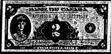
Click to view supersized image

Charlton ref. BC-3. Set of 2 consecutive serial numbered notes, both gem uncirculated. Serial numbers A2739809 and A2739810. Completely original, well centered, sharp corners, bright and fresh. This is as good as they get.